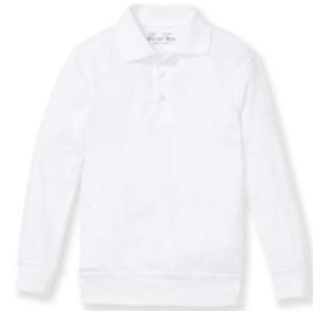
Long Sleeve Banded Bottom Polo Shirt with heat transferred logo