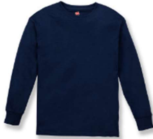
Long Sleeve T-Shirt with heat transferred logo