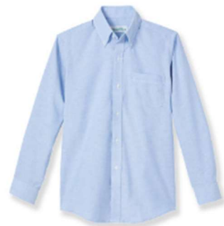
Long Sleeve Oxford Shirt