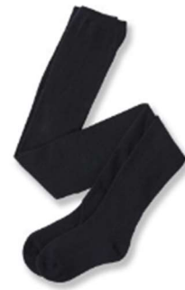
Opaque Nylon Knee-Hi