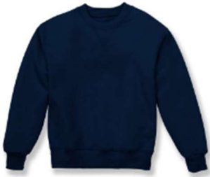
Heavyweight Crewneck Sweatshirt with heat transferred logo