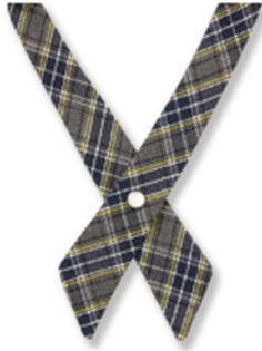
Girls' Criss-Cross Tie