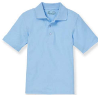
Short Sleeve Polo Shirt with heat transferred logo