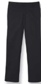
Girls' Flat Front Slacks