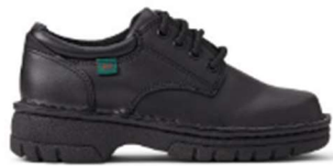
Children's Oxford Shoe