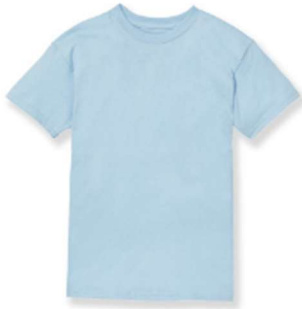
Short Sleeve T-Shirt with heat transferred logo