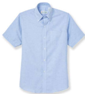
Short Sleeve Oxford Shirt