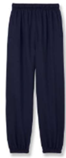
Heavyweight Sweatpants with heat transferred logo