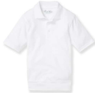
Short Sleeve Banded Bottom Polo Shirt with heat transferred logo