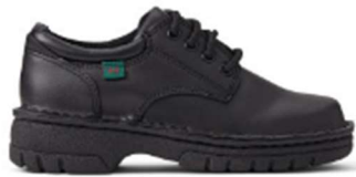
Women's Eastland Oxford Shoe