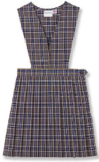
Split Front Jumper with school emblem