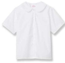
Short Sleeve Peterpan Collar Blouse