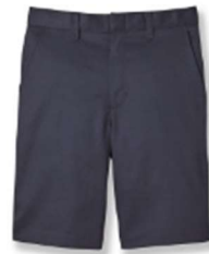
Boys' Twill Walking Shorts