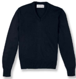
V-Neck Pullover Sweater with school emblem