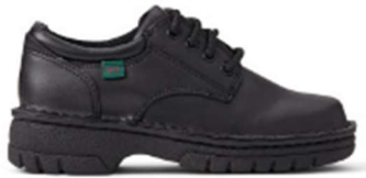
Women's Eastland Oxford Shoe