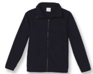
Full-Zip Fleece Jacket