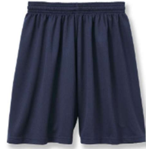
Micromesh Gym Shorts