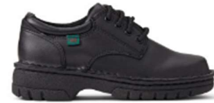
Children's Oxford Shoe