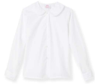
Long Sleeve Peterpan Collar Blouse