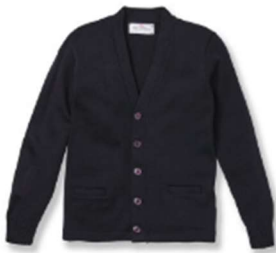
V-Neck Cardigan Sweater with school emblem