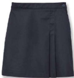
2 Pleat Skort